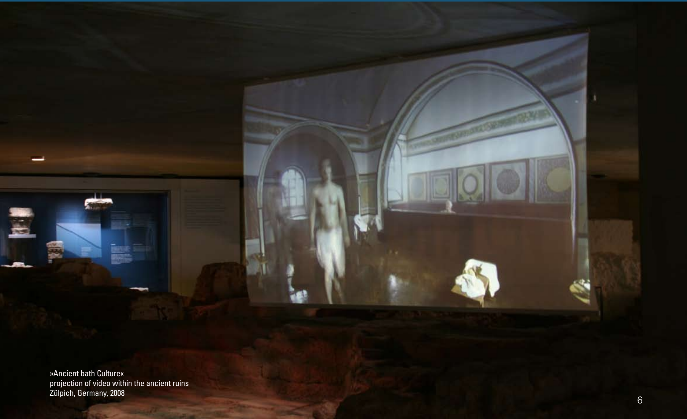
»Ancient bath Culture« projection of video within the ancient ruins Zülpich, Germany, 2008