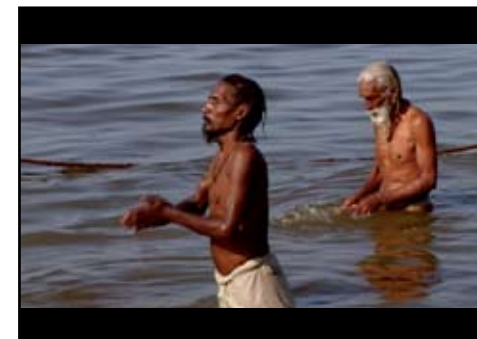
»2000 Years of bath culture« permanent interactive installation, detail and screenshots, feature film about Hinduism Zülpich, Germany, 2008