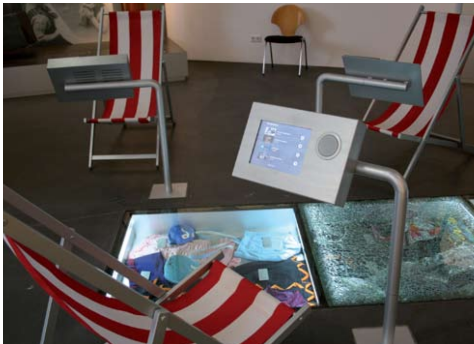
»2000 Years of bath culture« interactive multimedia exhibit, overview and interface Zülpich, Germany, 2008